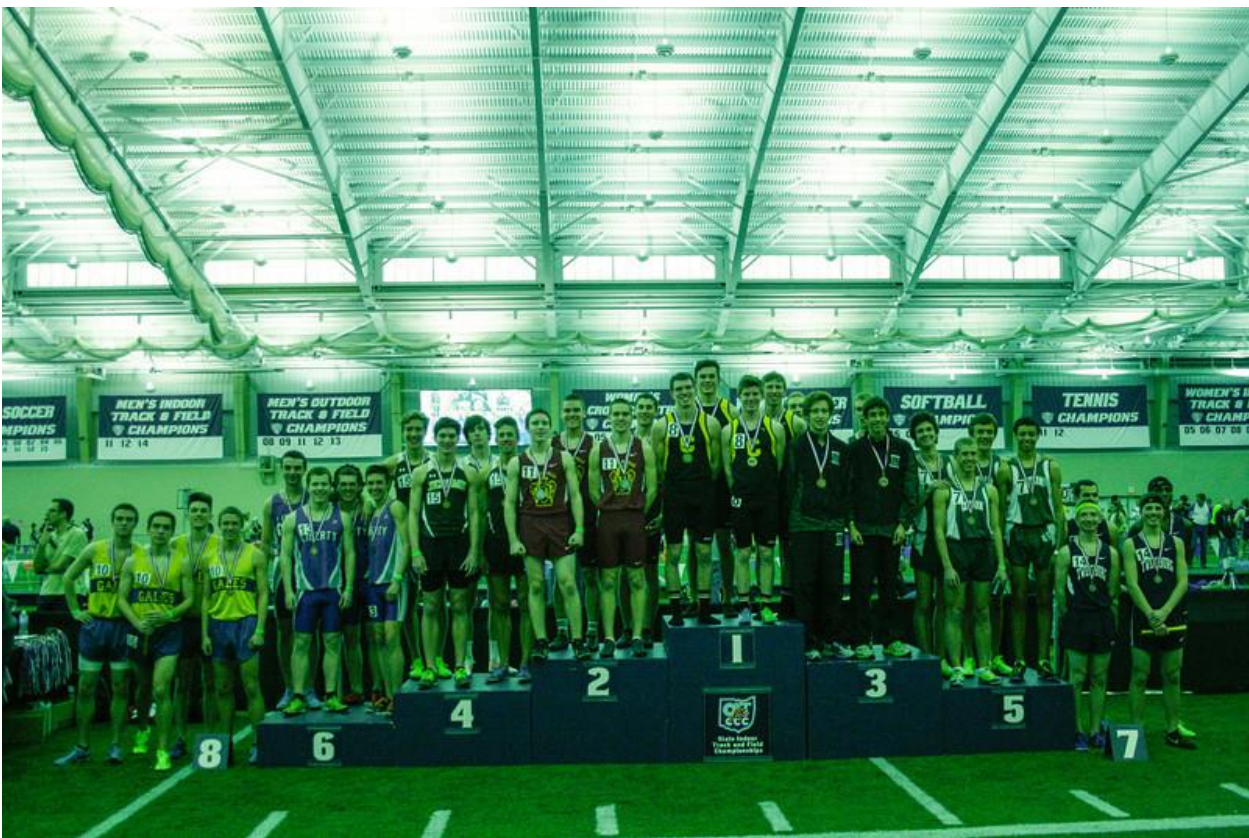
Results: Central District Indoor, Kent State Qualifer #3 March 1st & 2nd, 2014